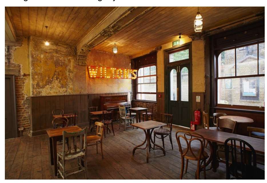
The first floor Cocktail Bar looks like this:

The ground floor Mahogany Bar looks like this: